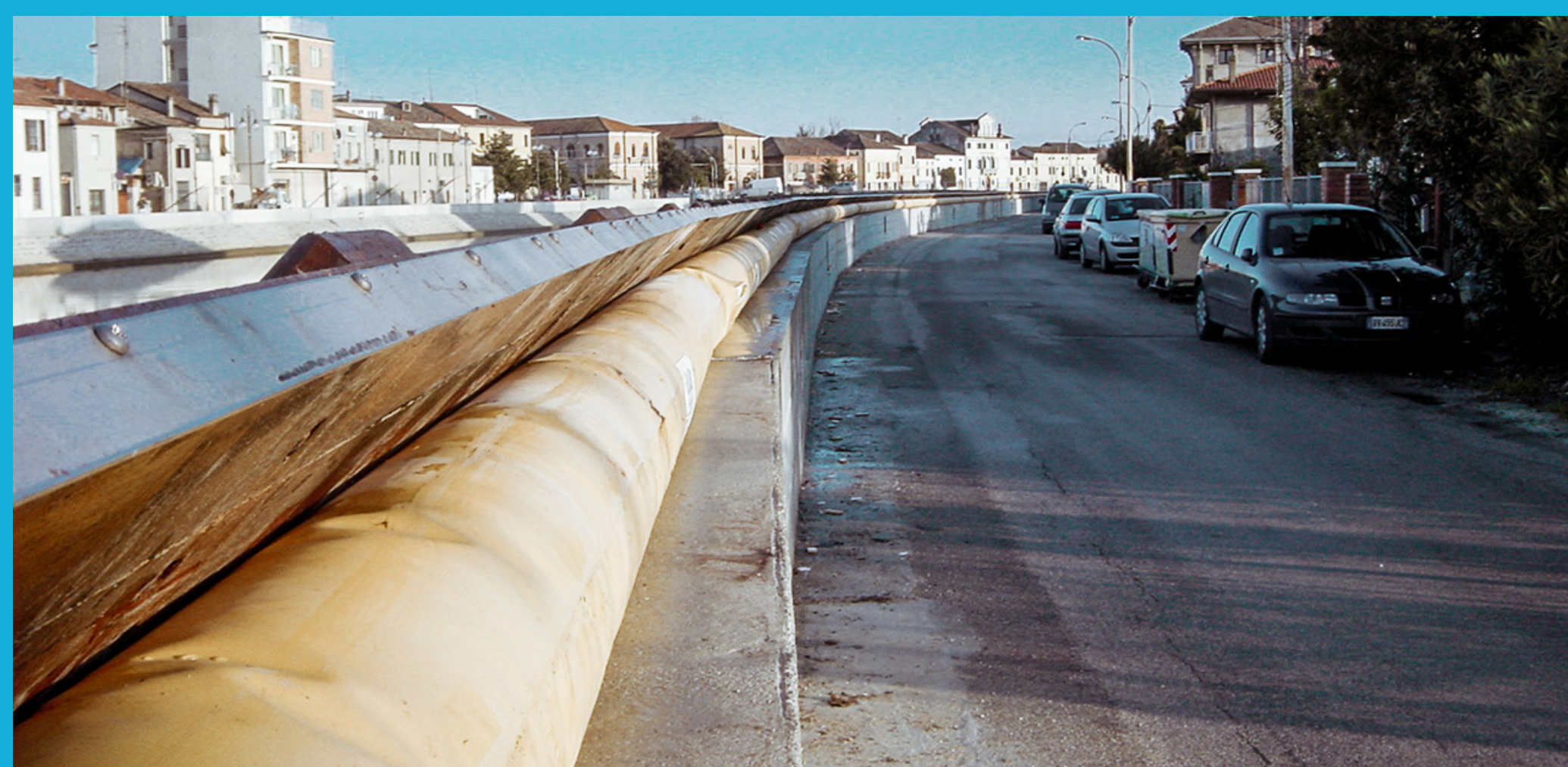
Right bank- Po di volano – Codigoro (FE)