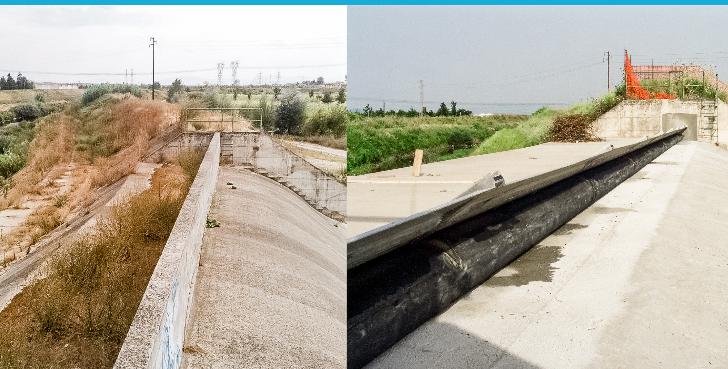
River drain – Quarrata (PT)