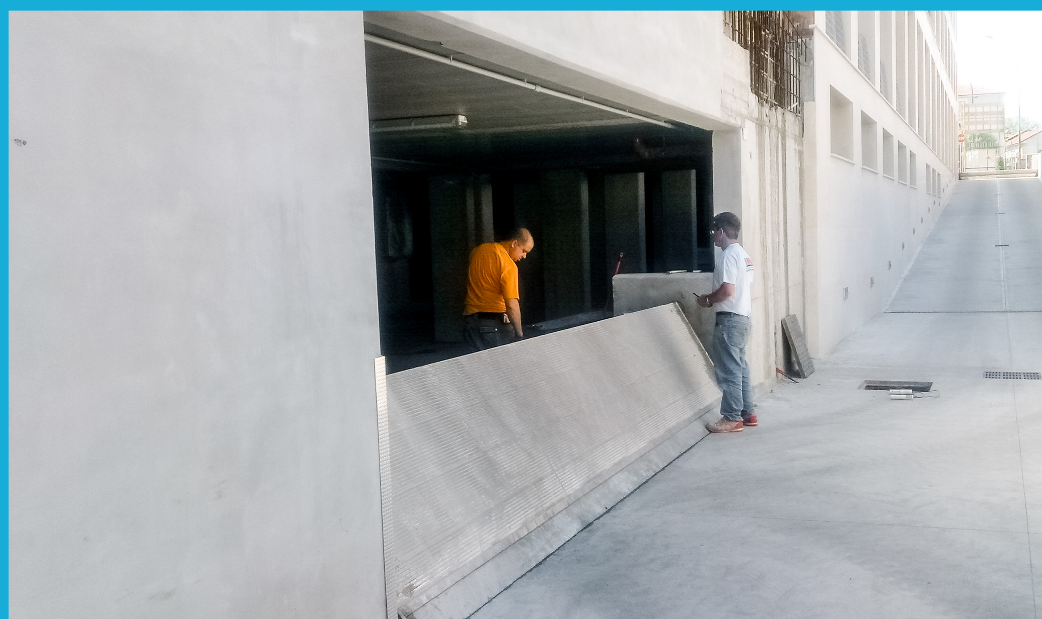
Underground parking - Saluzzo (CN)